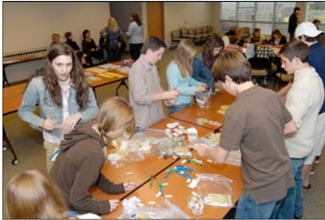
Assembling goodie bags