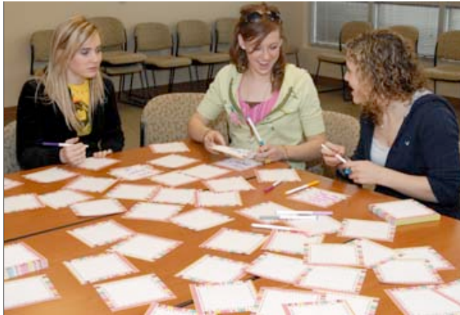
Writing notes of encouragement

More information at www.RichardsonRegional.com/Foundation or 972-498-7678.